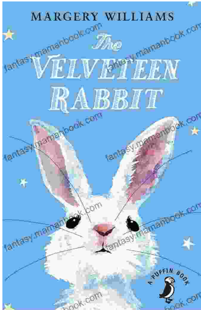
THE VELVETEEN RABBIT by Margery Williams