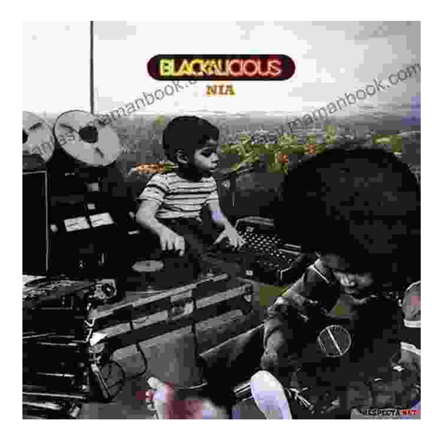
Nia: A Poetic and Uplifting Journey through Hip Hop

Nia is the debut album from Blackalicious, a hip hop duo known for their lyrical dexterity and socially conscious messages. The album's title, meaning "purpose" in Swahili, reflects the group's commitment to using their music as a force for good.