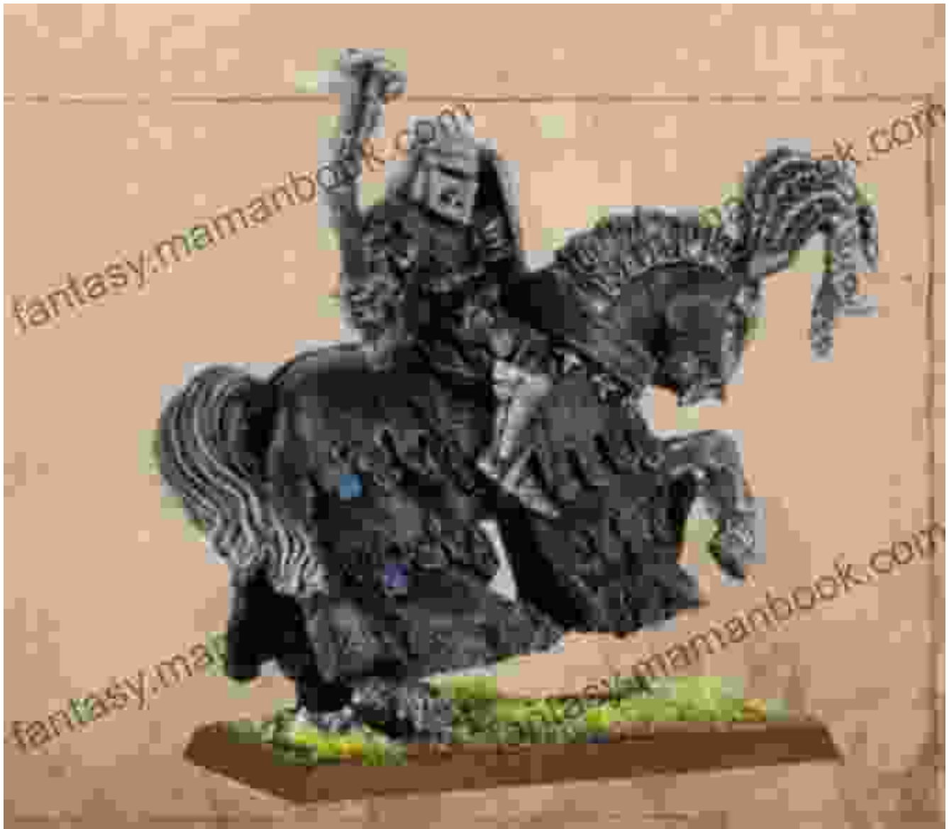
Maldred leading his army of trolls