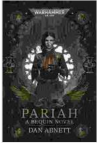
figure whose abilities and origins have fascinated fans for years. This article delves into the intricate tapestry of Bequin's existence, exploring her mysterious past, extraordinary powers, and unwavering determination in the face of seemingly insurmountable odds.