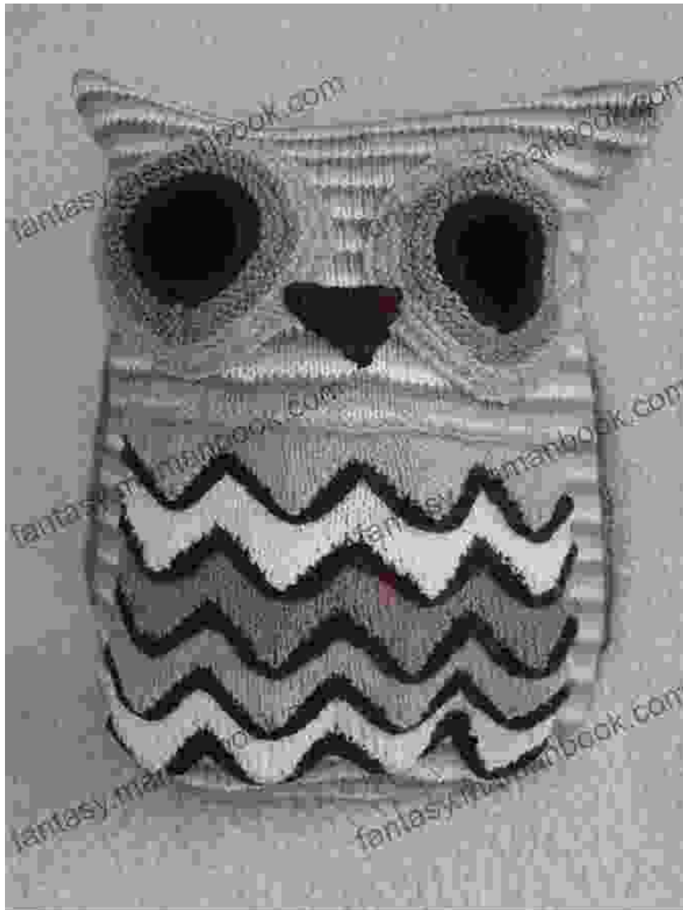
Owl Pyjama Case