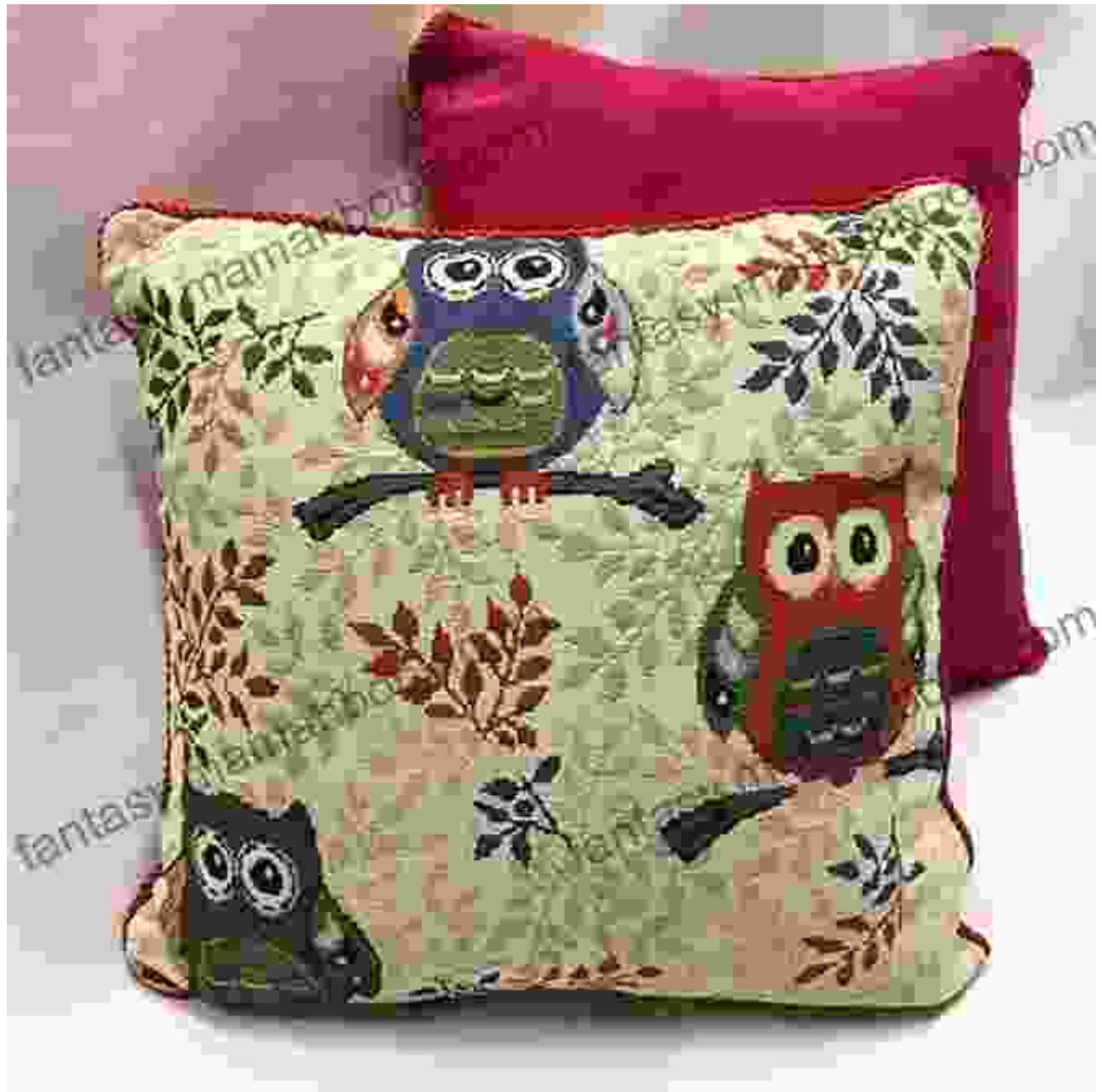
Owl Cushion Cover