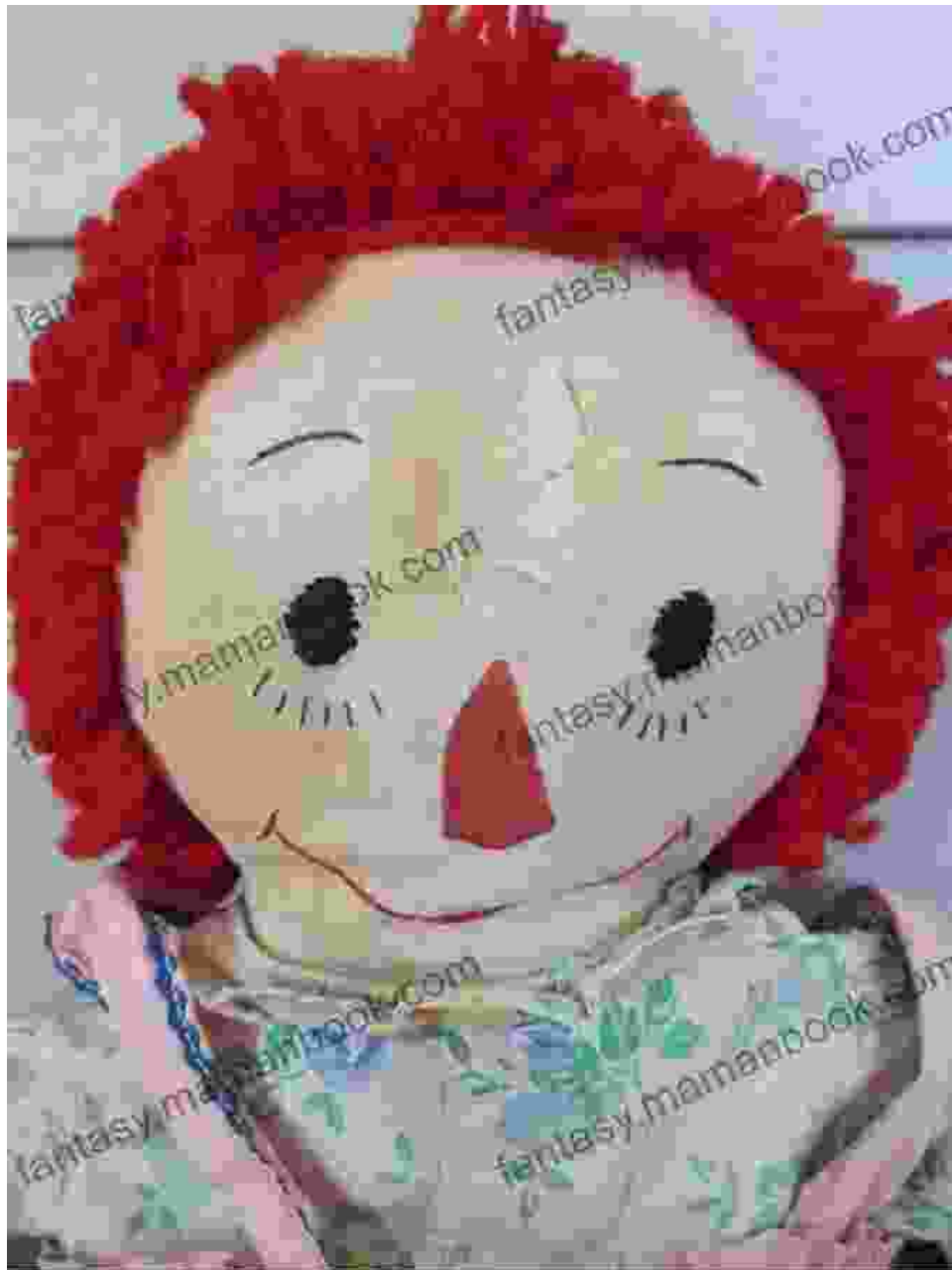
Meticulously Crafted Facial Features